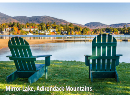
Mirror Lake, Adirondack Mountains