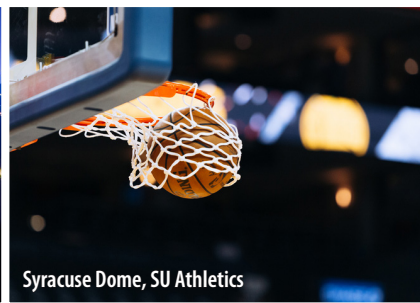
Syracuse Dome, SU Athletics