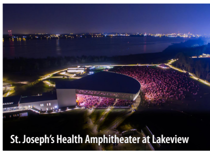
St. Joseph's Health Amphitheater at Lakeview