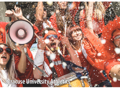
Syracuse University Athletics