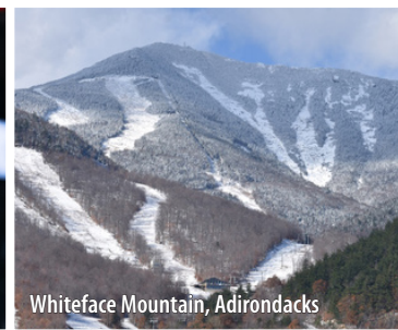
Whiteface Mountain, Adirondacks