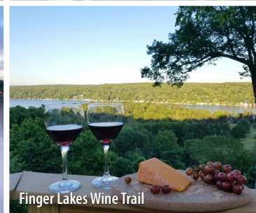
Finger Lakes Wine Trail