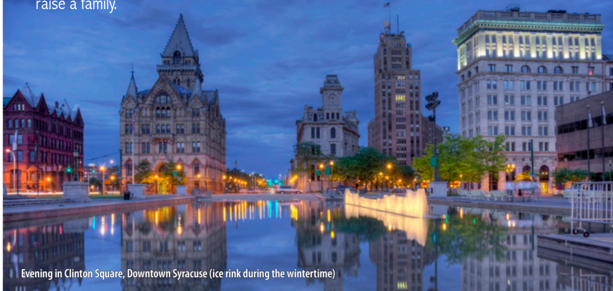
Evening in Clinton Square, Downtown Syracuse (ice rink during the wintertime)

From tech, the arts, cultural events, and beautiful natural surroundings to sports and seasonal outdoor activities, Onondaga County is a great place to live, work, play, and raise a family.