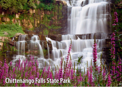
Chittenango Falls State Park