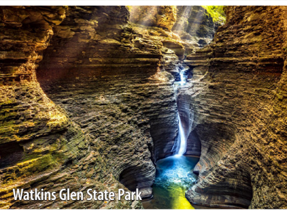
Watkins Glen State Park