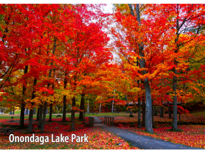
Onondaga Lake Park